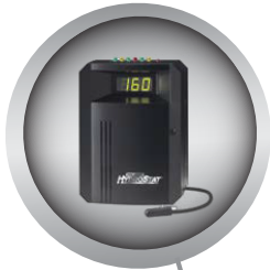
Optional HydroLevel Boiler Control with LWCO Protection